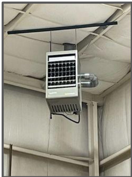
4-Modine 150,000 BTU Gas Unit Heaters. These will be available for pick up mid October. Units will be sold individually.

The Spring Bluff Board of Education has determined the following items are surplus. These items will be sold to the highest bidder. All bids should be submitted to the school office by 3 p.m. 9/14/22 in a sealed envelope including name and amount offered. All items are sold in 'as is' condition. Bids will be opened at the 9/15/22 Board of Education meeting. You do not need to be present at the meeting. Please contact Jeannie Jenkins if you would like to schedule a time to look at the surplus items. 573-457-8302