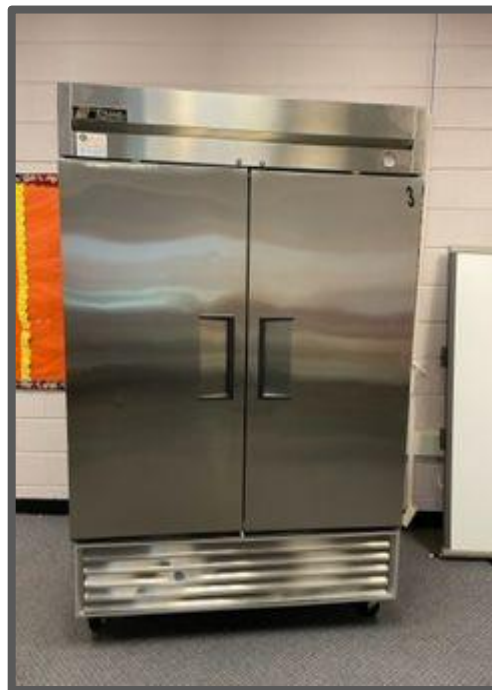
2006 1HP-2 door True Freezer